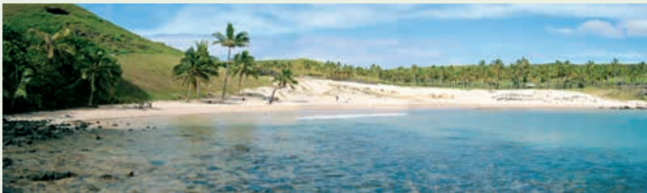
*moai: stone statues of human figures